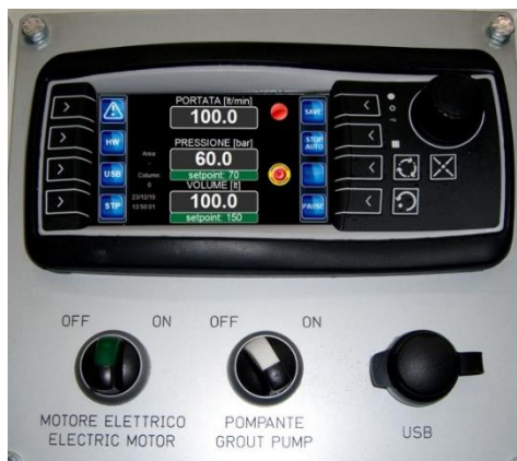
LCD Pump Control panel (optional) with recording system and preset volume / pressure injection control