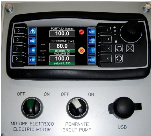
LCD Pump Control panel (optional) with recording system and preset volume / pressure injection control