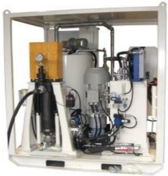
LCD Pump Control panel (optional) with recording system and preset volume / pressure injection control