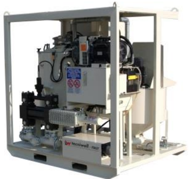
LCD Pump Control panel (optional) with recording system and preset volume / pressure injection control