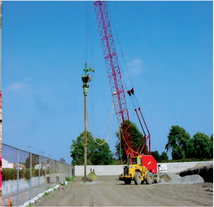
Bottom-Feed Stone Columns